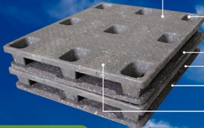
PW-2 40" x 48" Pallet (with base)